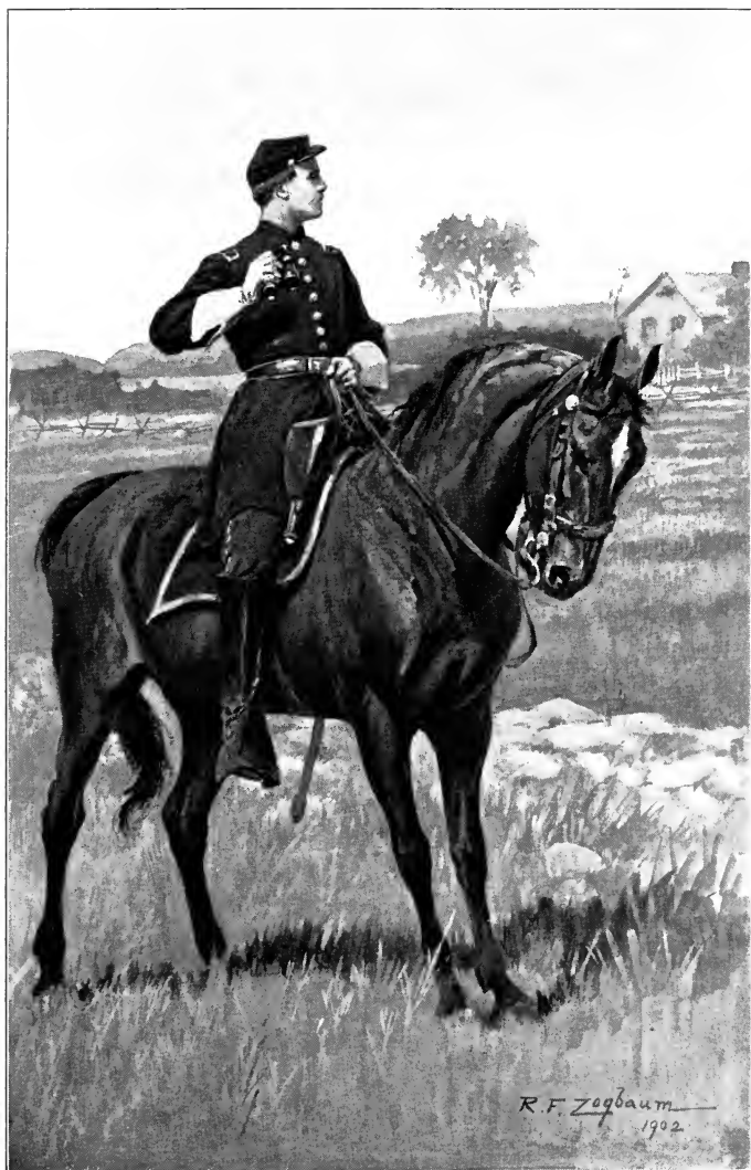
In front of him stood the old Virginia homestead.—Page 67.